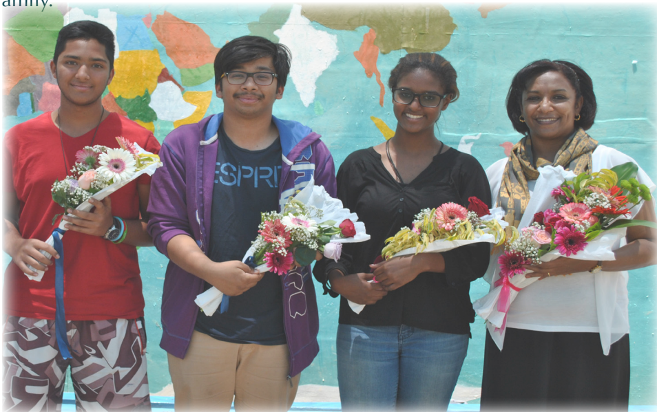
The Ericsson Winners!

This is a proud moment for our school and for the KAS Family."