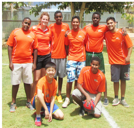
Good Try Boys Volleyball Team!